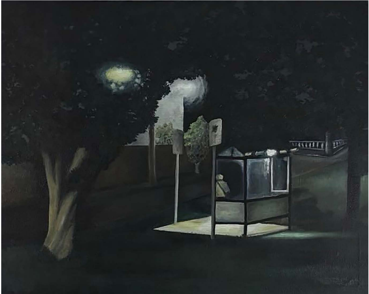
Early Morning (at the bus stop), 2025; oil on canvas

Longing for a way to share scenes of wonder from memories and dreams, Lu Morgan uses visual media to make representational art that aims to transport viewers to a quiet or atmospheric place. Morgan primarily paints with oils and draws with a range of mixed media.