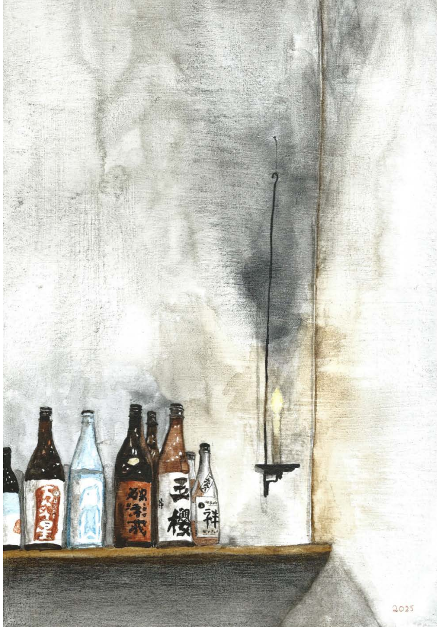
Sasaki, 2025; Mixed media on Fabiano 240gsm