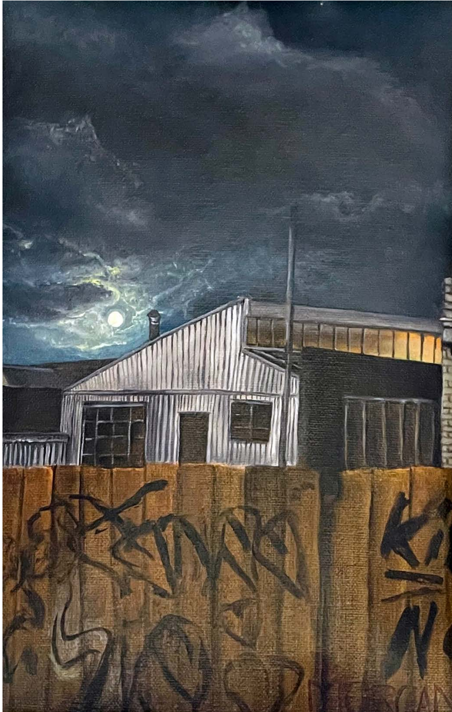
Moonlight 1, 2025; oil on canvas