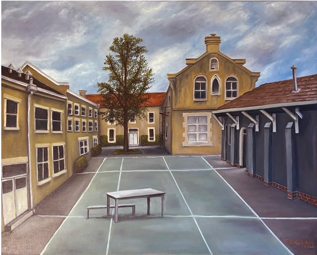
Sacred Heart, 2025; Oil on canvas