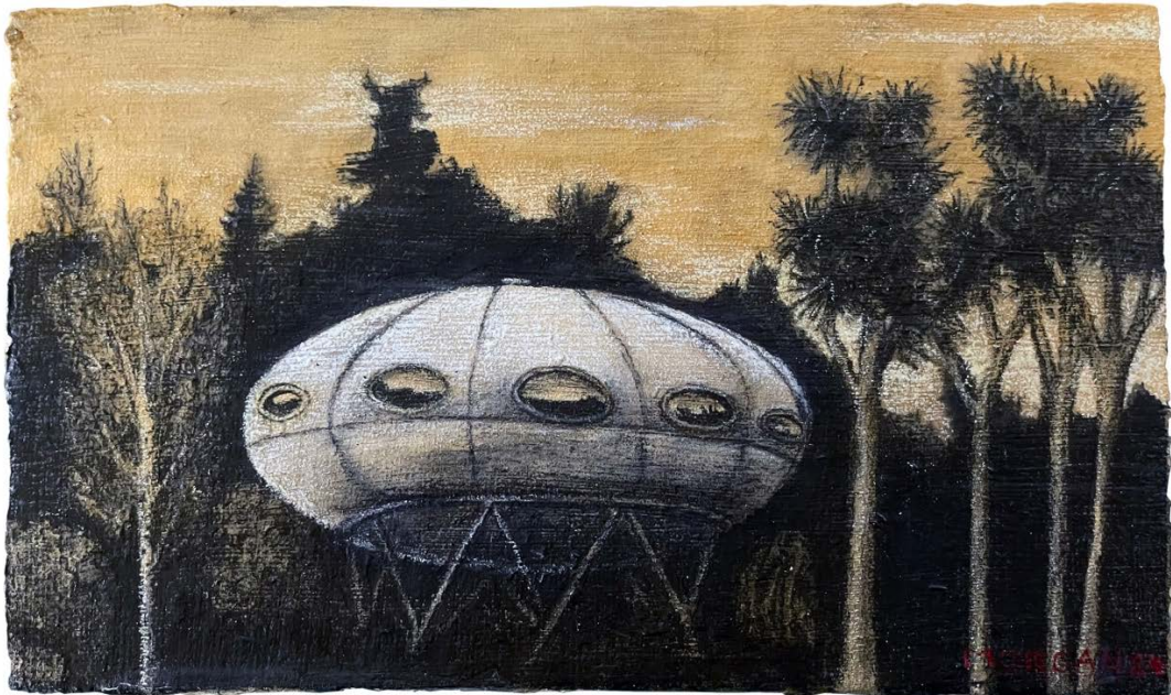
Futuro 1, 2024; mixed media on engineered floorboard

Morgan has recently relocated from Aotearoa (New Zealand). After four years in Ōtepoti on a semi-rural property with an orchard and extensive vegetable gardens, Morgan is adjusting back to urban life in Australia on Wurundjeri land in Naarm (Melbourne).