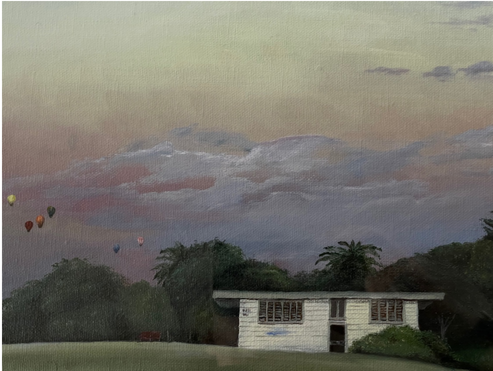
Wattle Park 2 (detail), 2024; Oil on canvas