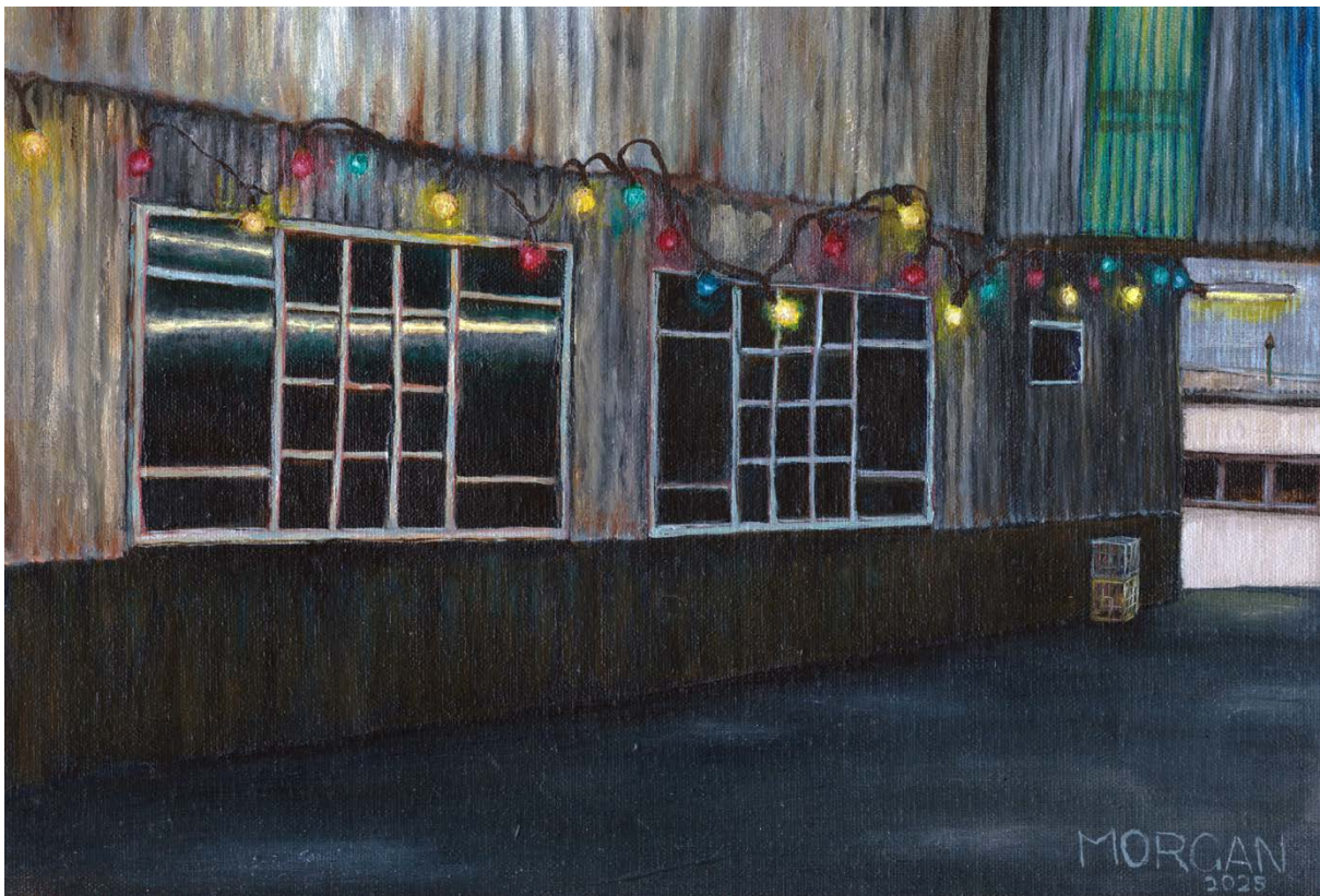
Cockatoo Island study, 2025; Oil on canvas