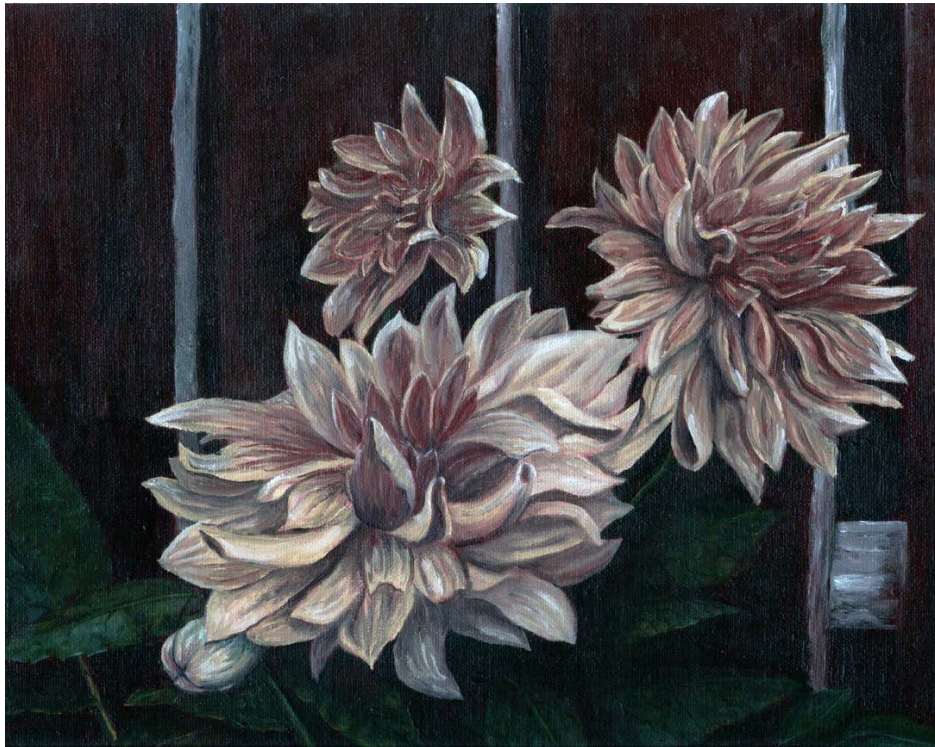
Dahlias (detail), 2025; Oil on canvas