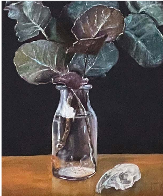
Silver dollar and skull (detail), 2025; oil on canvas