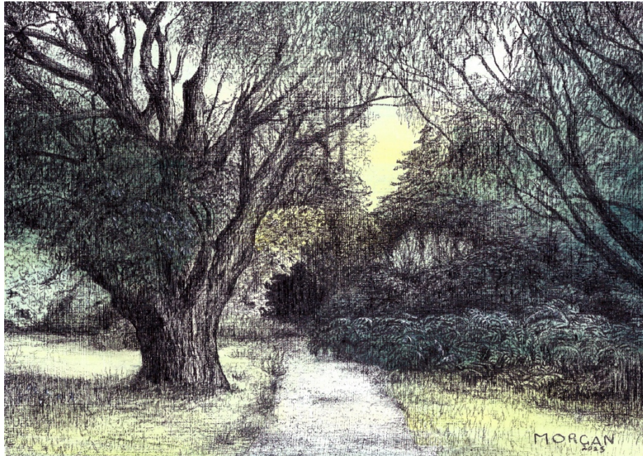
Sunrise 3 "Wattle Park", 2025; Gouache and graphite on Fabriano 240gsm